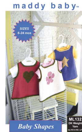
ML132 Baby Shapes Knit just one or all three of these sweet little tops, decorated with a star, flower, or heart. Sizes Infants 6-24 months Yarn DK Weight (22 sts=4"/10cm)