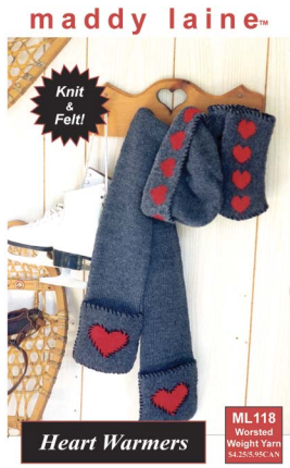
ML118 Heart Warmers Knit and felt a heart-motif hat with felted band, knit scarf with felted pockets, and wristwarmers. Sizes One size Yarn Worsted Weight (20 sts=4"/10cm)