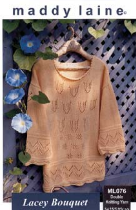
ML076 Lacey Bouquet Women's pullover with fan-shaped edges and motif of lace-stitch flowers arranged in a bouquet. Sizes Women S, M, L Yarn DK Weight (21 sts=4"/10cm)

Wholesale inquiries? Bryson Distributing 1-800-544-8992