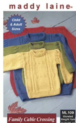
ML109 Family Cable Crossing Classic-styled sweaters with cross-cable motif in child and adult sizes. Sizes Child S, M, L Adult S, M, L, XL Yarn Worsted Weight (20 sts=4"/10cm)