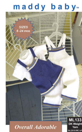
ML133 Overall Adorable Cute as a button overalls in short or long pants style with straps that crisscross at back to button on bib. Sizes Infants 6-24 months Yarn DK Weight (22 sts=4"/10cm)