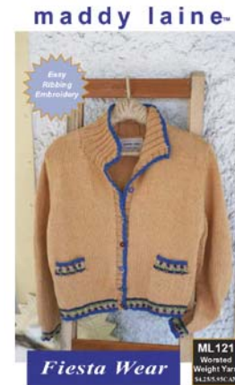
ML121 Fiesta Wear Stripes band together to border a cardigan with simple embroidery that adds texture and color. Sizes Women XS, M, L, XL Yarn Worsted Weight (20 sts=4"/10cm)