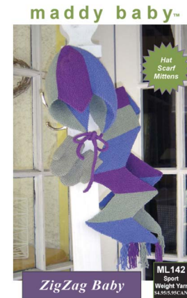
ML142 ZigZag Baby A hat that zigs and zags over tiny ears and little foreheads, with a fun-shaped scarf and mittens. Sizes Infants 6-24 months Yarn Sport Weight (25 sts=4"/10cm)

Larger image format including detailed information available at maddycraft.com