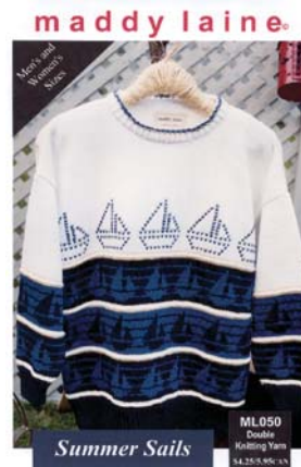
ML050 Summer Sails A pullover sized for men and women featuring knitted and duplicate stitch sailboat motif. Sizes Men M, L Women M, L Yarn DK Weight (21 sts=4"/10cm)