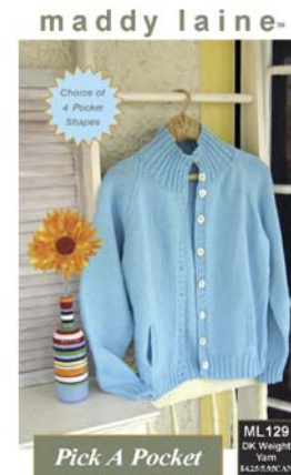
ML129 Pick A Pocket A classic raglan-sleeve cardigan to customize with your choice of one of four pocket shapes. Sizes Women S, M, L, XL Yarn DK Weight (22 sts=4"/10cm)