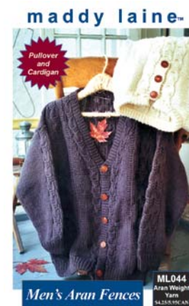
ML044 Men's Aran Fences Men's sweater in pullover and cardigan styles with slipped stitch fences and folded cables. Sizes Men S, M, L Yarn Aran Weight (17 sts=4"/10cm)