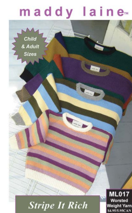
ML017 Stripe It Rich Family-sized pullover to knit in a choice of stripes - wide, medium, or narrow. Sizes Child M, L Adult S, M, L, XL Yarn Worsted Weight (19 sts=4"/10cm)