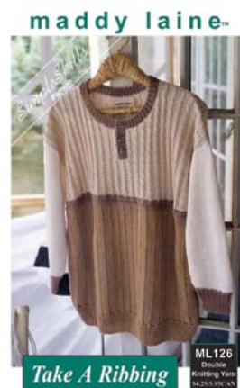
ML126 Take A Ribbing Men's pullover in slip stitch rib and mock cable pattern. Subtle colors allow the texture to shine. Sizes Men S, M, L, XL Yarn DK Weight (22 sts=4"/10cm)