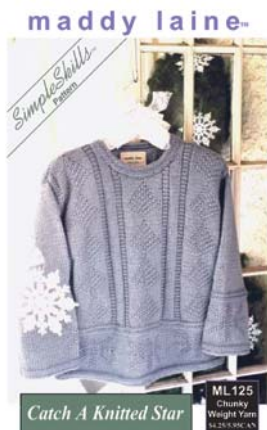
ML125 Catch A Knitted Star Stitch motifs of stars and trees combine in a pullover finished with a double-border pattern. Sizes Women S, M, L Yarn Chunky Weight (15 sts=4"/10cm)