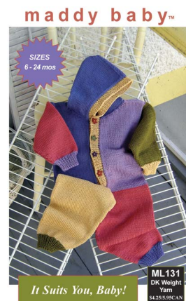
ML131 It Suits You, Baby! A one-piece suit for baby in bright blocks of color with buttoned front opening and attached hood. Sizes Infants 6-24 months Yarn DK Weight (22 sts=4"/10cm)