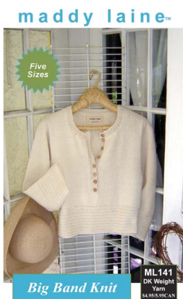
ML141 Big Band Knit Wide bands of horizontal ribbing accent a cropped-length pullover and three-quarter length sleeves. Sizes Women XS, S, M, L, XL Yarn DK Weight (22 sts=4"/10cm)