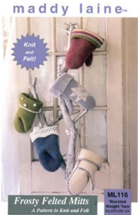
ML116 Frosty Felted Mitts Knit and felt to create "fabric". Fashion a variety of mitts in a choice of five different styles. Sizes Women S, M, L Yarn Worsted Weight (20 sts=4"/10cm)