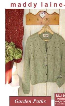
ML130 Garden Paths A women's cardigan with zig-zag paths of twisted stitches leading to a garden of knot-stitch flowers. Sizes Women S, M, L Yarn Worsted Weight (19 sts=4"/10cm)