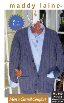
ML140 Men's Casual Comfort Men's cardigan in wide rib pattern with V-neck shaping and handy pockets. Sizes Men S, M, L, XL Yarn Worsted Weight (20 sts=4"/10cm)