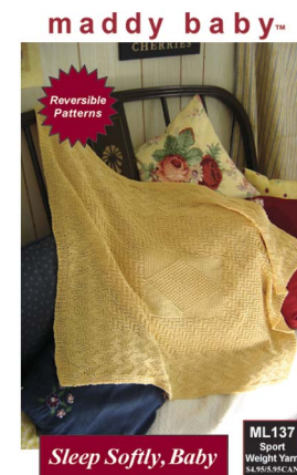
ML137 Sleep Softly, Baby Reversible stitch patterns create matching texture on both sides of this baby blanket. Sizes 24½ x 33½"/62.5 x 85cm Yarn Sport Weight (24 sts=4"/10cm)