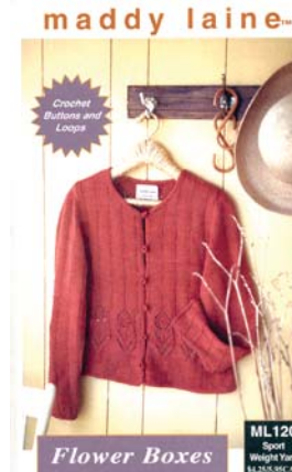
ML120 Flower Boxes Checks and lace square off in this cropped-length cardigan, finished with cording and crochet buttons. Sizes Women S, M, L Yarn Sport Weight (23 sts=4"/10cm)