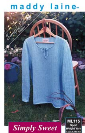
ML115 Simply Sweet Women's pullover knit in simple mock rib pattern with corded garter edges and neckline tie. Sizes Women S, M, L, XL Yarn Sport Weight (24 sts=4"/10cm)