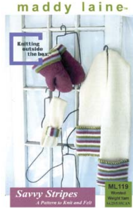
ML119 Savvy Stripes Women's knit headband with felted tie, felted mitts, and knit scarf with felted pockets. Sizes Women S, M, L Yarn Worsted Weight (20 sts=4"/10cm)