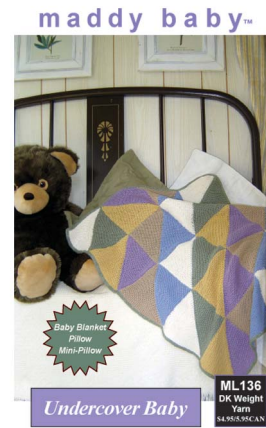
ML136 Undercover Baby Triangles of garter stitch are an easy-to-knit project for family and friends awaiting the new arrival. Sizes 24½ x 33½"/62.5 x 85cm Yarn DK Weight (22 sts=4"/10cm)