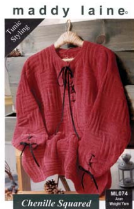
ML074 Chenille Squared Women's tunic, knit in squares of rib pattern with garter stitch trim, side-vent openings, and lacing. Sizes Women S, M, L Yarn Aran Weight (18 sts=4"/10cm)