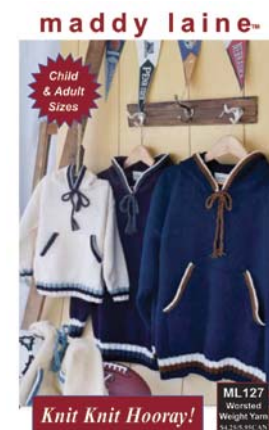
ML127 Knit Knit Hooray! Knit these family-sized pullover hoodies in your favorite school or team colors. Sizes Child S, M, L Adult S, M, L, XL Yarn Worsted Weight (20 sts=4"/10cm)

Larger image format including detailed information available at maddycraft.com