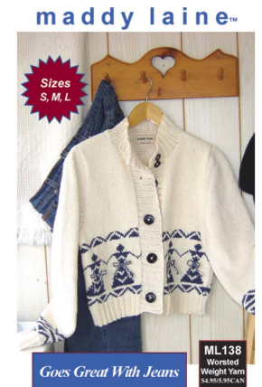
ML138 Goes Great With Jeans Dancing ladies circle this close fitting cardigan, accented with wide ribbing and braided bows. Sizes Women S, M, L Yarn Worsted Weight (20 sts=4"/10cm)