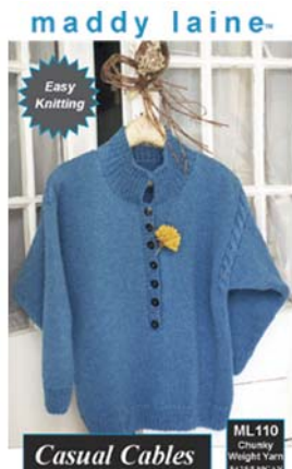
ML110 Casual Cables Women's easy-to-knit pullover with cable trim, front-buttoned opening, and stand-up collar. Sizes Women S, M, L, XL Yarn Chunky Weight (15 sts=4"/10cm)