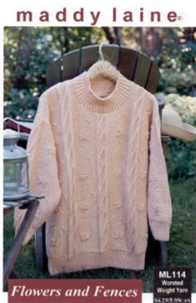
ML114 Flowers and Fences Women's pullover styled with cables enclosing delicate flower and vine embroidered motifs. Sizes Women S, M, L, XL Yarn Worsted Weight (20 sts=4"/10cm)