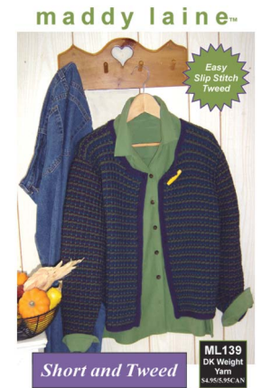
ML139 Short and Tweed An easy slip stitch pattern combines three colors to create a tweed-textured jacket. Sizes Women S, M, L, XL Yarn DK Weight (22 sts=4"/10cm)