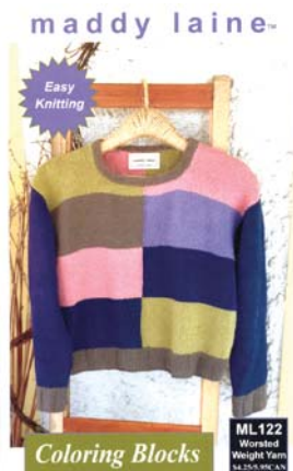
ML122 Coloring Blocks Just fill in the blocks with color in this easy-to-knit pullover with wide ribbing and set-in sleeves. Sizes Women XS, S, M, L, XL Yarn Worsted Weight (20 sts=4"/10cm)