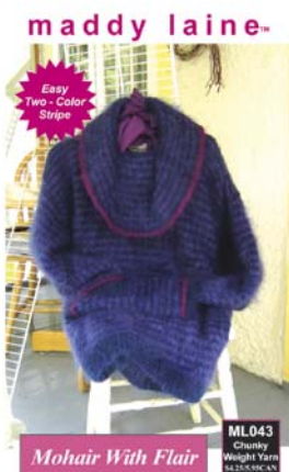
ML043 Mohair With Flair Women's pullover with long and luxurious styling, contrast welting, and kangaroo pocket. Sizes Women S, M, L Yarn Chunky Weight (16 sts=4"/10cm)